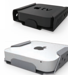
Apple TV & Mac mini mounts