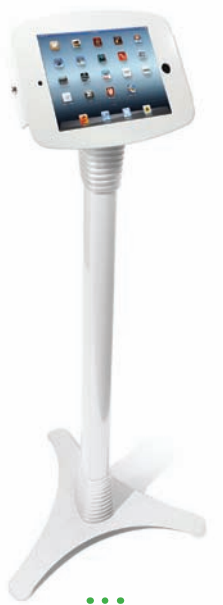
... iPad floor stand

The number one priority for government offices is to keep sensitive & private information safe.