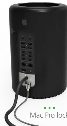
Mac Pro lock