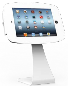
... iPad enclosure kiosk