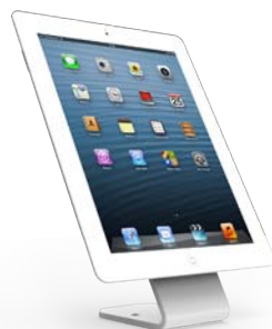
... iPad lockable holder

Apple products have transformed the typical office environment.