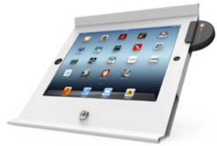
••• iPad/iPad mini POS