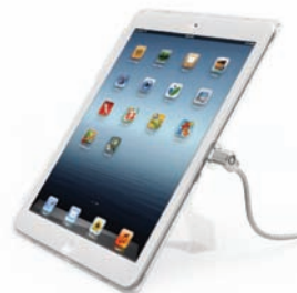
iPad security case