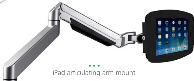
... iPad articulating arm mount