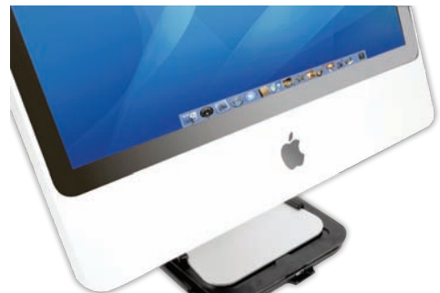
... iMac security plate