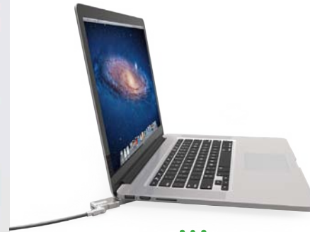
MacBook security case or bracket