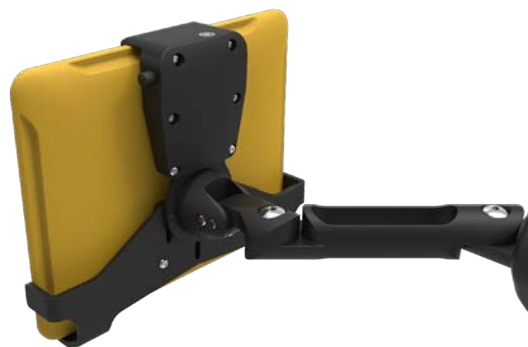
... Universal rugged case holder