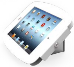
••• iPad flipping kiosk