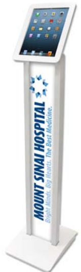
iPad BrandMe Stand

Maclocks is the largest global provider of secure iPad solutions used in the healthcare industry