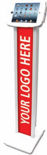
••• BrandMe Stand

Maclocks secured display solutions help your business use their Apple products to their fullest capabilities.