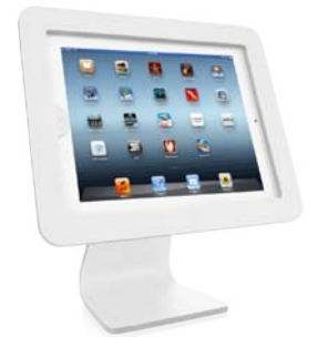
... iPad rotating kiosk