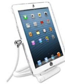
iPad rotating stand