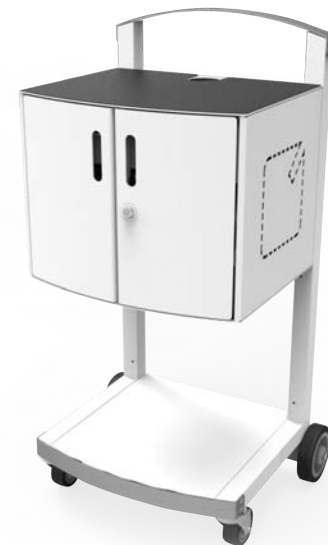
iPad security charging cart

The way we teach and learn has evolved. Powerful creative tools such as Macs & iPads have transformed the classroom by offering endless learning possibilities that empower educators and students.